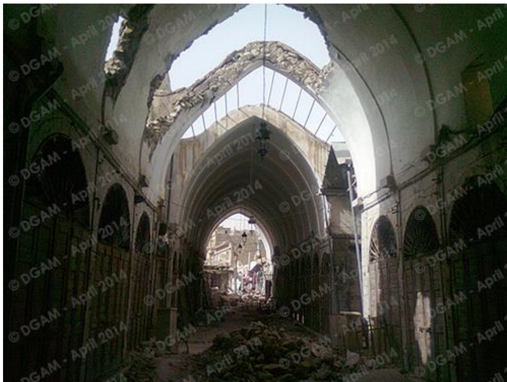
(Photo of the souq (market) in Deir ez Zor. )